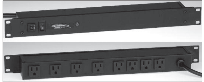
16293-16294 (Front & Back)

Sentrex and Perma Power Rack Mount and CabinetMATE Surge Protectors provide advanced protection for critical electronic and communications equipment. They are an integral part of the Sentrex zoned approach to whole building protection.