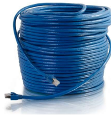
75ft Cat6 Snagless Solid Shielded Ethernet Network Patch Cable