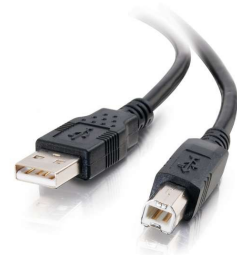
3.3ft (1m) USB 2.0 A/B Cable