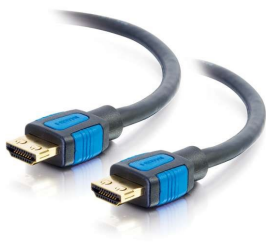
3ft High Speed HDMI Cable With Gripping Connectors