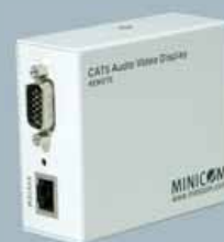
AV Extender Remote