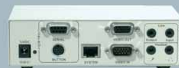
AV Extender Transmitter