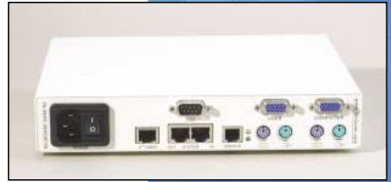
Phantom MX II Manager