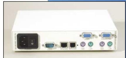
Universal Phantom Manager