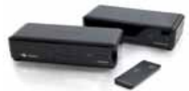
TruLink® 1-Port 60 Ghz WirelessHD® Kit