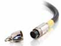
RapidRun® CL2-Rated PC Runner Cable