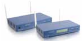
TruLink® Wireless Digital Signage Distribution System (Transmitter & Receiver)

Healthcare-rated power cords are coming soon. Contact your account manager for more details.