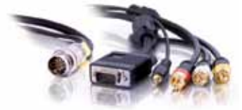
RapidRun® HD15 + 3.5mm + Composite Video + Stereo Audio Flying Leads