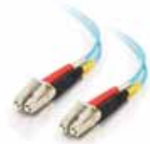
10 Gb 50/125 LOMMF Aqua Fiber