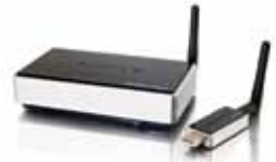
TruLink® Wireless USB to VGA with Integrated Audio Kit