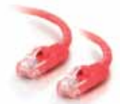
Cat5e 350MHz Snagless Patch Cable